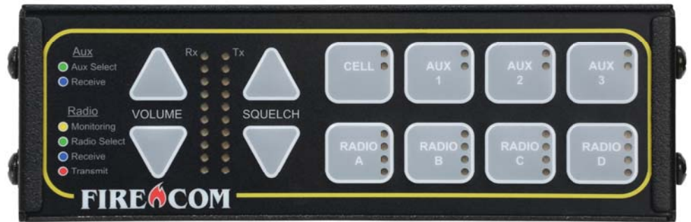
5400D Digital Intercom

Digital Intercom 5100D, 5200D 5300D, 5400D