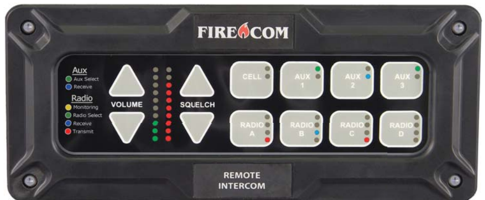
5400DRH Remote Head

The Digital Intercom is customizable to accommodate new or existing radio and intercom configurations, interfaces up to four additional devices including cell phones, and is 100 percent retrofit compatible with existing Firecom installations.